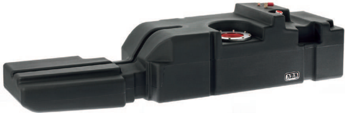
Ranger Frontier tank shown