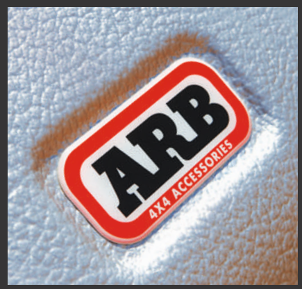
Textured exterior canopies are available as an option for the Navara, with colour coding also an option.

Colour coded to complement the vehicle. The canopy pictured here is our smooth exterior finish.