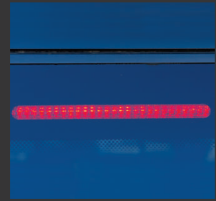
An LED brake light is fitted to all our Navara canopies, providing high output with low current draw.

All our canopies come with an internal light to make it easier to locate work tools and other gear in dark conditions.