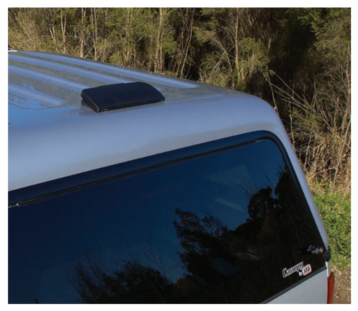
The innovative slimline, high flow canopy vent is the ideal solution to reduce dust ingress and improve airflow for your Classic canopy. With the vent facing the front of the vehicle, the canopy interior is pressurised, reducing dust from entering the area via the rear door or tailgate when travelling off road.