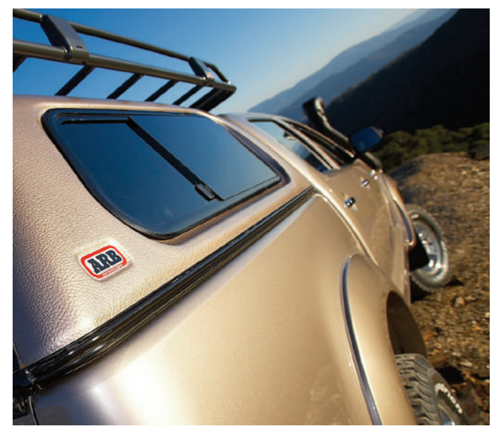
Sliding side windows are manufactured with tempered and tinted safety glass. Flyscreens can be fitted to these for increased practicality, especially if the vehicle is to be used as an occasional sleeping area.